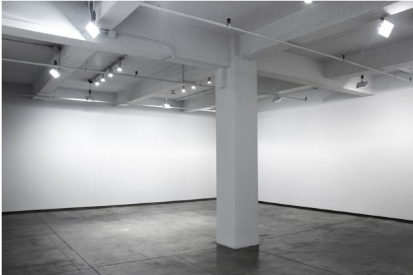
Two Pages, 2015, Self-adhesive archival paper on wall, Dimensions variable, exhibition view