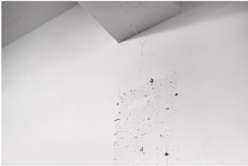
Gray Optimism, 2015, Self-adhesive archival paper on wall, 108 x 13.5 inches, detail