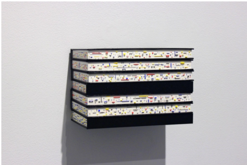
Stacking Quotes (Black Cachet), 2015, Self-adhesive archival paper on 7 cachet notebooks, full view