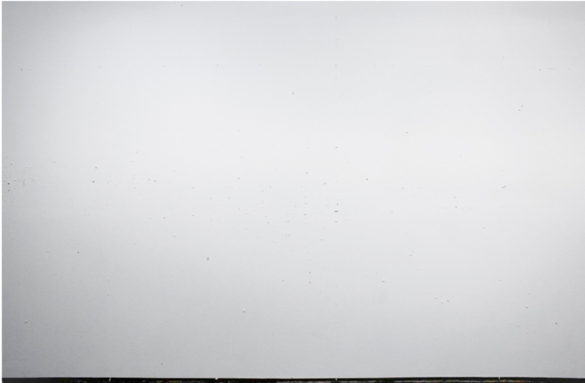
Marco Maggi, Two Pages, 2015, Self-adhesive archival paper on wall, Dimensions variable, view two