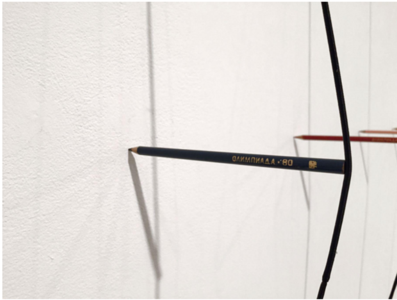
Putin's Pencils, 2015, 10 Soviet era color pencils, bowstrings and hooks,