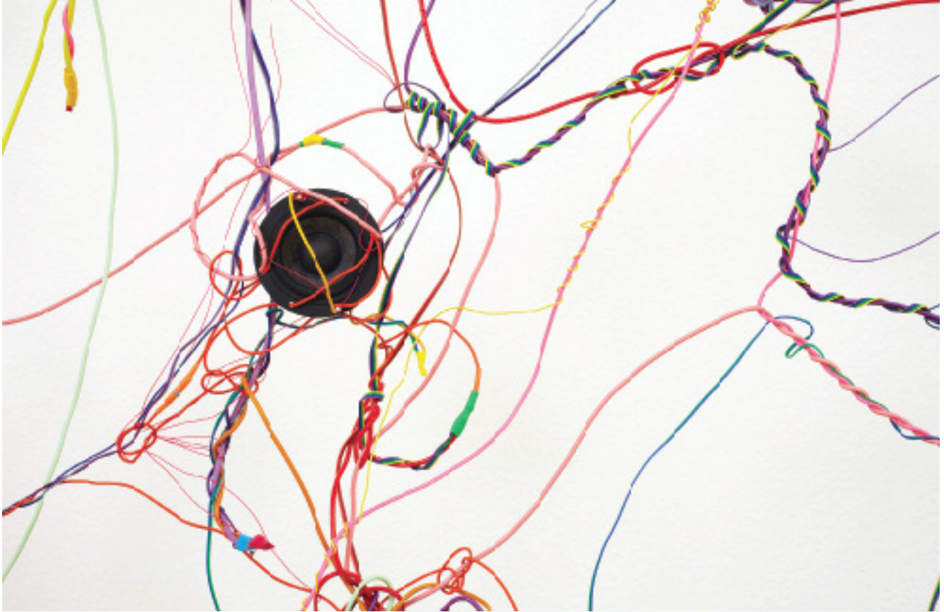
Loop , 2010–11. Speakers, wire, electronics, and 8-channel soundtrack, 158 x 140 x 10 in.

density of presence with a total paring down of material—is an activation of space as energy. Even though some Minimalist work was all about mass, I feel like the way Minimalism brought the body into a relationship with an object is similar to how I work. If I can reduce the experience to the sparsest material element, then I will. I appreciate and strive for reduction, concentration, and a focusing of gesture, but I see what I do as both minimal and maximal. Some of my works are not minimal at all; they're more expressive, like Loop .