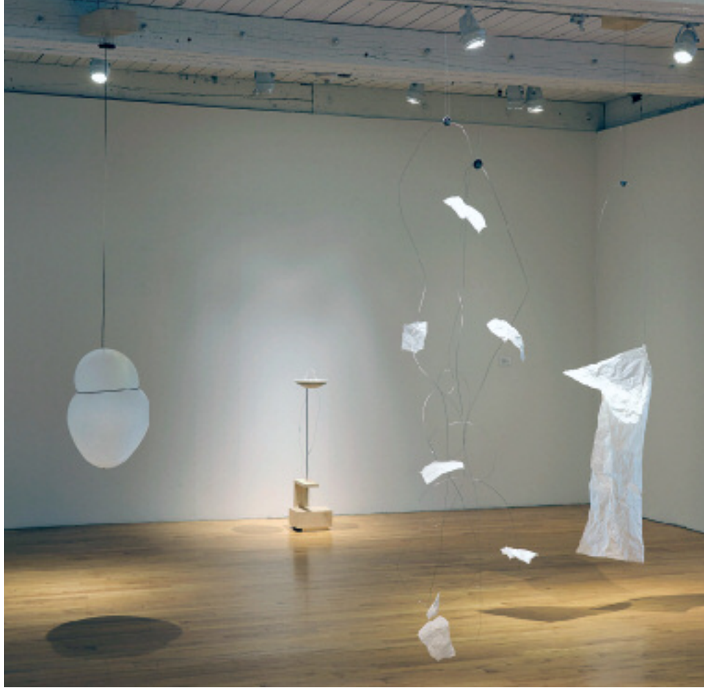
Above: Bone Scores , 2016. Stainless steel, abaca paper, unglazed porcelain, magnet wire, magnets, latex amplifiers, soundtracks, and wood, view of installation at MASS MoCA. Below: Terrain , 2007–08. Speakers, wire, electronics, computer, custom software, and 12-channel soundtrack, view of installation at the Indianapolis Museum of Art, 2008.

JR: Do you see this work as a guide for image or light through architecture? Is