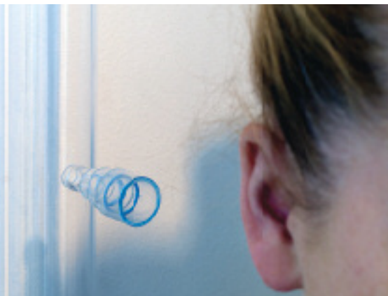
Above: Blue Sky with Rainbow , 2015–16. Solar collector, sunlight, fiber-optic cable, custom PVC cladding, prism, lens, and acetate, interior detail. Left and below: How Deep is Your , 2012. PVC and plastic tubing, Plexiglas, funnel, mirror, record player, records, LEDs, and 2-channel soundtrack, 2 views of installation at the deCordova Sculpture Park and Museum.

JS: I definitely feel a relationship to the Minimalist movement. Those were some of the first works that moved me deeply, especially the work of Fred Sandback. His ability to suggest substantial presence using the least amount of material really struck me. That equation—