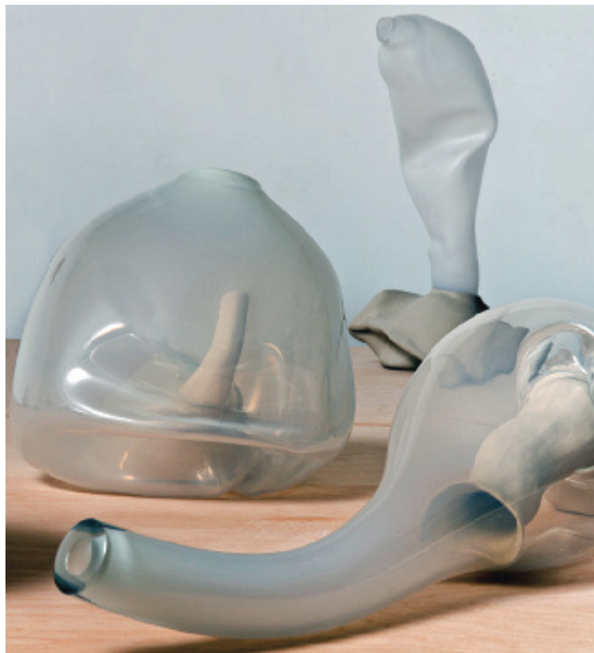
Re-Sounding Vessels , 2016. Blown glass, unglazed porcelain, electronics, and sound generated from the objects, dimensions variable.