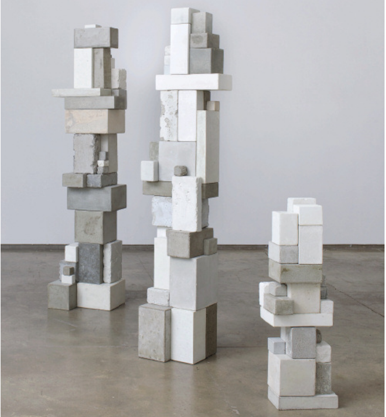
Surrogate (JS), Surrogate (KRL), and Surrogate (ARL), 2012. White and gray cement, mica, and 143 clock movements inside the blocks, 3 elements, 68 x 18 x 12 in., 72 x 24 x 14 in., and 40 x 17 x 8 in.

out. A goal of my work is to induce people to see, hear, and feel with a different quality of attention than what we are usually accustomed to.